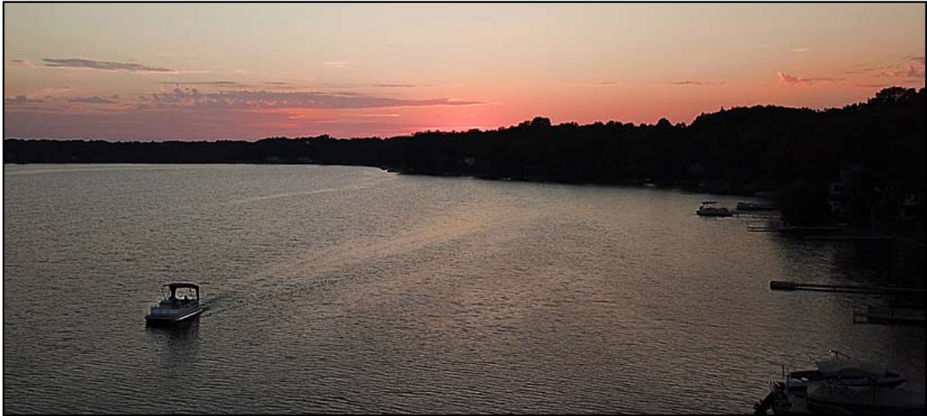
A solitary boater enjoys a peaceful sunset cruise.

The newsletter is in color on the website and Facebook.