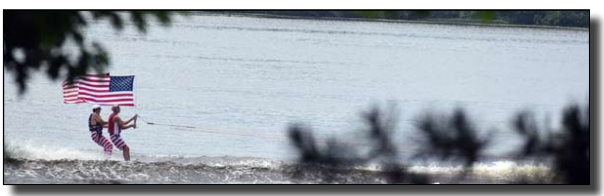
A great start to the July 4th boat parade.

(Editors note: The above article was posted on the lake association Facebook page in early June to reach as many residents as possible.)