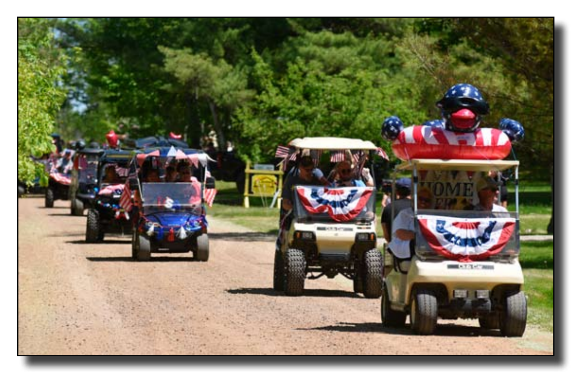
The first ATV/golf cart parade heads down Hardwood Heights Memorial Day weekend.