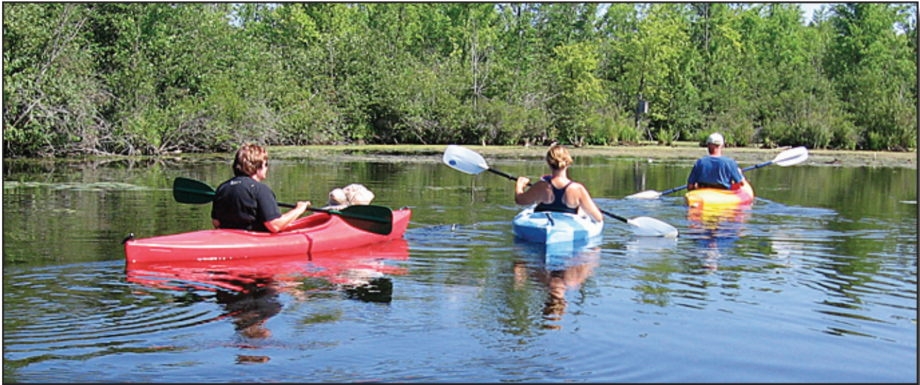
Kayakers explore the northeast corner of Hardwood Lake.